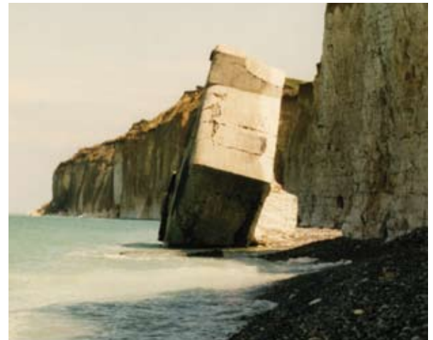
The Class of '96 had an unscheduled bus "stop" (breakdown) just outside of Dieppe. Yes - that is a bunker, point down in the beach.

The Normandy Scholar Program endeavors to keep the memories of the Second World War alive by studying its causes, conduct, consequences, and contemporary representations first in the classroom, then in the field.